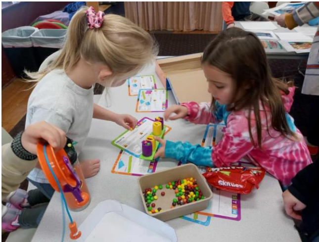
4-H Fun comes to the Library!